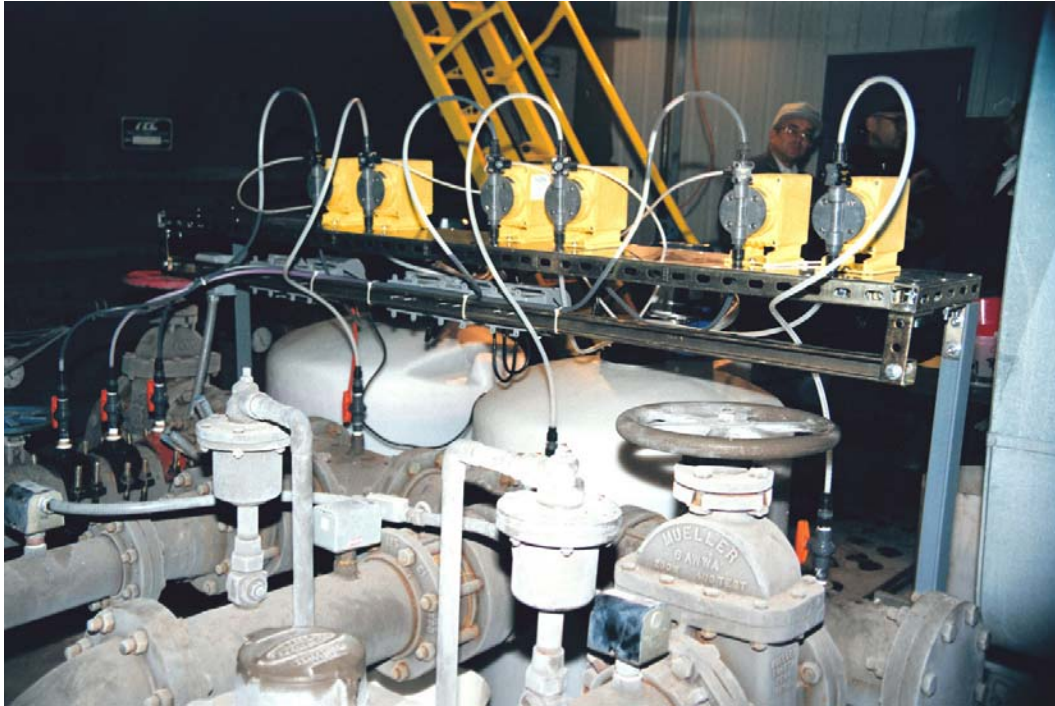
SVEN Chemical Injection Pumps and SVEN Injection Valves